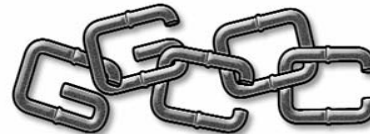
GREATER GEORGETOWN CHAMBER OF COMMERCE

The Greater Georgetown Chamber of Commerce is an excellent source of area information and a vital resource for businesses and visitors. Strong Chamber leadership working in partnership with town and county officials keeps business and tourism in Georgetown viable and competitive. The Chamber Office & Visitor Center is located in the Historic Georgetown Train Station.