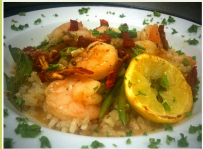
*New South - Shrimp Naples

Free Regular Dessert One coupon per visit/delivery. Expires 8.1.10 - GH Café Only